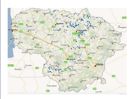
Agricultural land portfolio of INVL Baltic Farmland, AB

On June 30 the company has signed an agreement with INVL Farmland Management to transfer an administration of the assets to the third party.