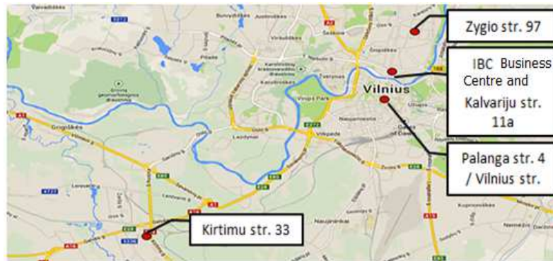
Real estate objects owned by group companies of INVL Baltic Real Estate, AB in Vilnius (Lithuania)