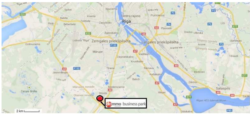
Real estate objects owned by group companies of INVL Baltic Real Estate, AB in Riga (Latvia)