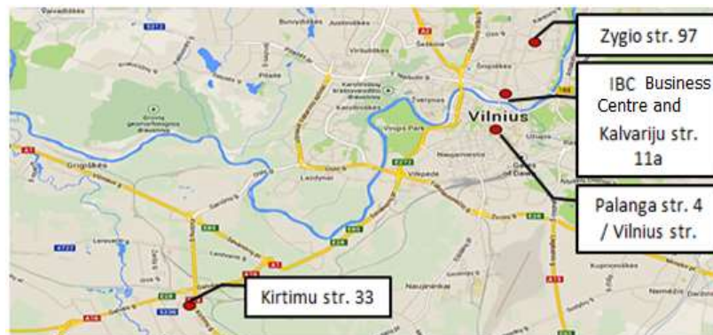
Real estate objects owned by group companies of INVL Baltic Real Estate, AB in Vilnius (Lithuania)